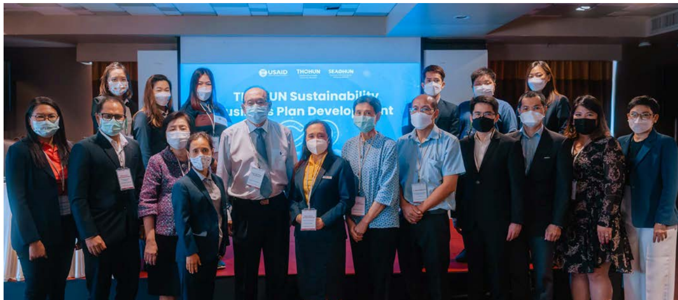
THOHUN conducted a two-day sustainability business plan development workshop at Siam Design Hotel in Bangkok, 9-10 January 2023.

THOHUN is planning to implement its sustainability plan by leveraging its strengths. To further organizational sustainability, THOHUN will promote its successful history of receiving multiple rounds of USAID funding, as well as funding support from high-profile private sector companies, to attract new donors. Furthermore, the breadth and depth of multi-disciplinary technical expertise of THOHUN members will be documented in the THOHUN database. THOHUN also hopes to create an extensive library of One Health-related curricula and training materials to promote One Health development and capacity building in Thailand. These activities are expected to be executed by the end of Year 4 of the OHW-NG project.