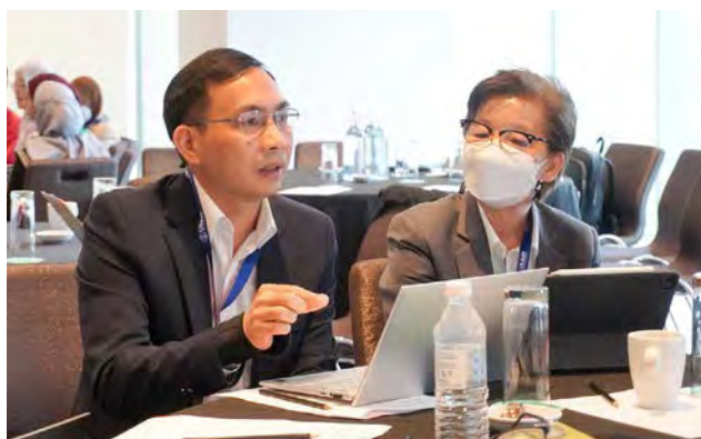
Group discussion during the Organizational Development Workshop in Malaysia.

The Secretariat has been working to promote One Health education for all with Chevron Corporation through its charitable contribution to the project of Strengthening One Health Education in Southeast Asia since January 2021. With high-quality outputs from the program implemented by SEAOHUN and its implementing partners, SEAOHUN received Phase II funding from Chevron, for the period of January 2023