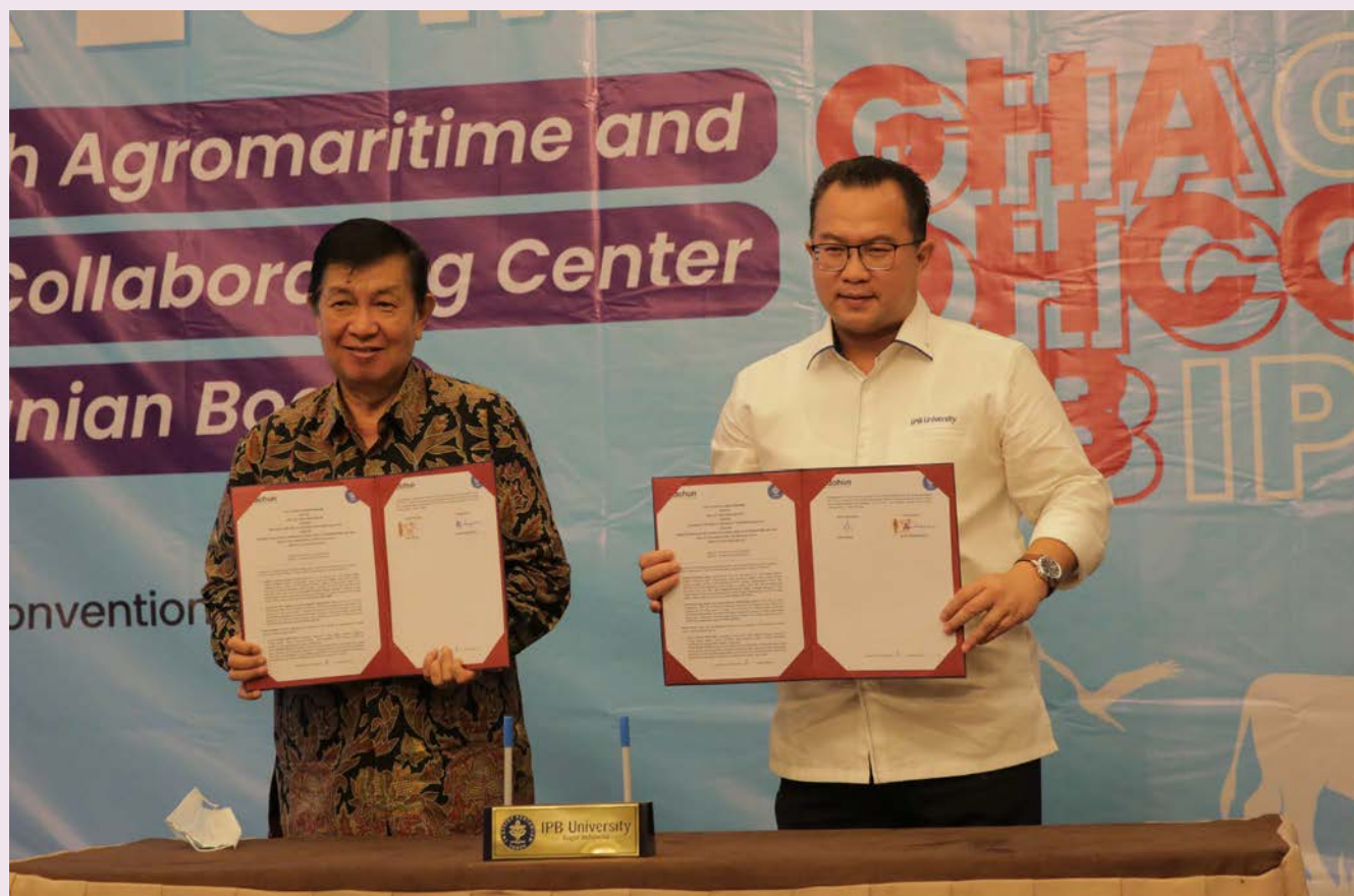
"The signing of a memorandum of understanding between IPB and the Indonesia One Health University Network (INDOHUN) with the full support of the Indonesian Ministry of Education, Culture, Research and Technology and the United States Agency for International Development (USAID) on 26 January 2023 at IPB International Convention Center, Bogor, West Java."

On 26 January 2023, GHA-OHCC IPB was established with the support of the Rector and Dean of School of Veterinary Medicine at IPC University. A breadth of One Health partners and stakeholders from across Indonesia attended the launch events, including the Secretary of the Directorate General of Higher Education from Indonesia’s Ministry of Education, Culture, Research, and Technology. Participants from stakeholder institutions provided positive feedback on the future of the GHA-OHCC IPB and look forward to the organization’s ability to mitigate the impacts of emerging communicable and non-communicable diseases, especially at the intersection of climate change, animal and human health ecosystems in Indonesia. The GHA-OHCC IPB will work to increase One Health awareness through multi-sectoral and interdisciplinary collaborations to ultimately address complex and dynamic One Health-related challenges in Indonesia.