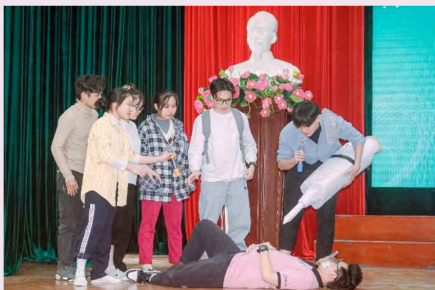
Students' performance during One Health Student Club Competition at Thai Binh University of Medicine and Pharmacy.

"This kind of activity is really meaningful for me, especially for the chance to exchange knowledge and build up communication skills that are very useful for me. I also want to thank the organizers and facilitators for this activity" - one of the students.