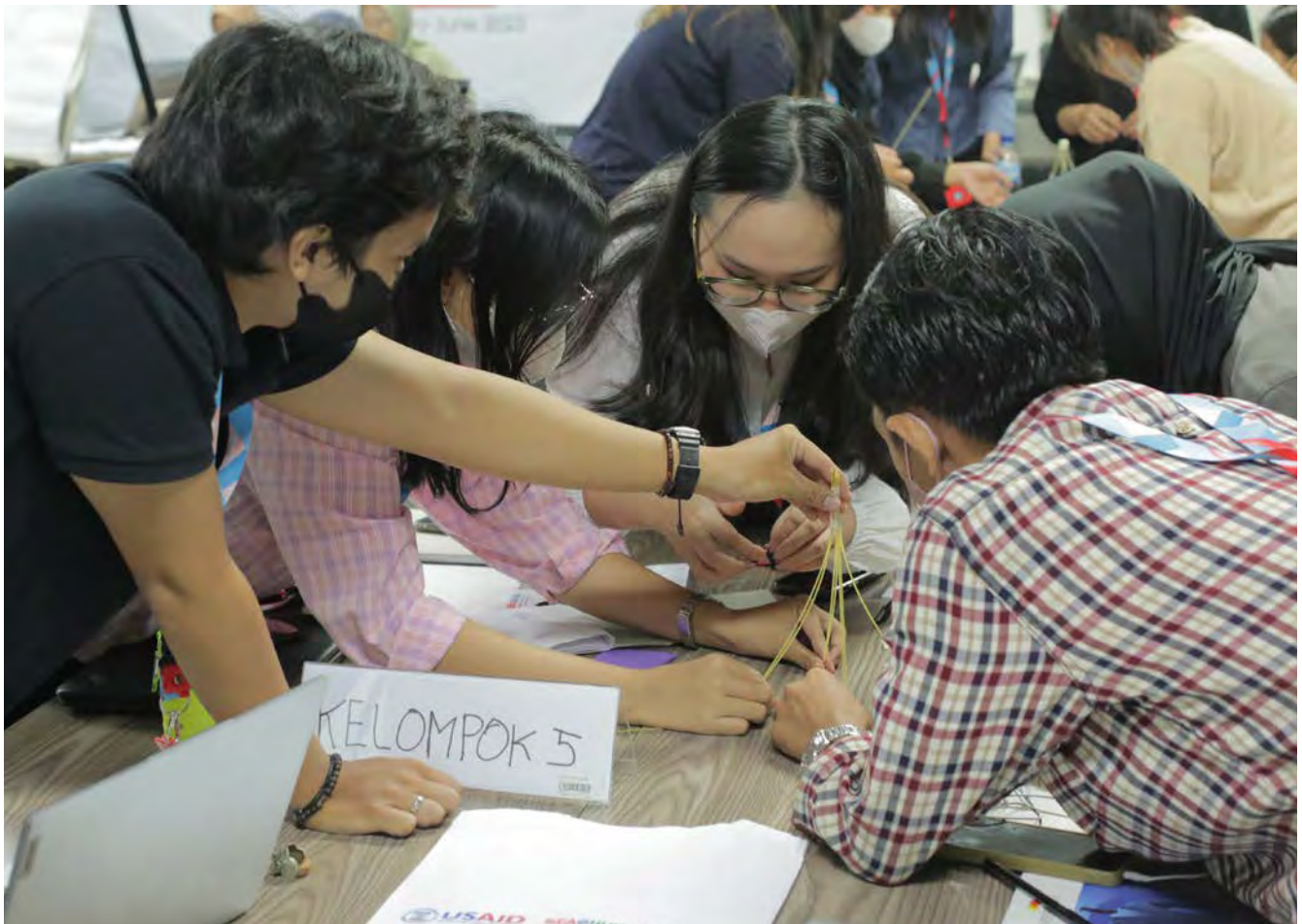
Students participating in One Health Young Leaders Internship Program, 21 March 2023.

Through the One Health Young Leaders (OHYL) Internship Program supported by the Ministry of Education Culture Research and Technology (MoECRT) of Indonesia, 29 students from eighteen universities across Indonesia are currently pursuing their practical hands-on professional learning experience. Towards further development of their education, they are gaining experience and implementing collaborative One Health approaches to strengthen their respective One Health competencies.