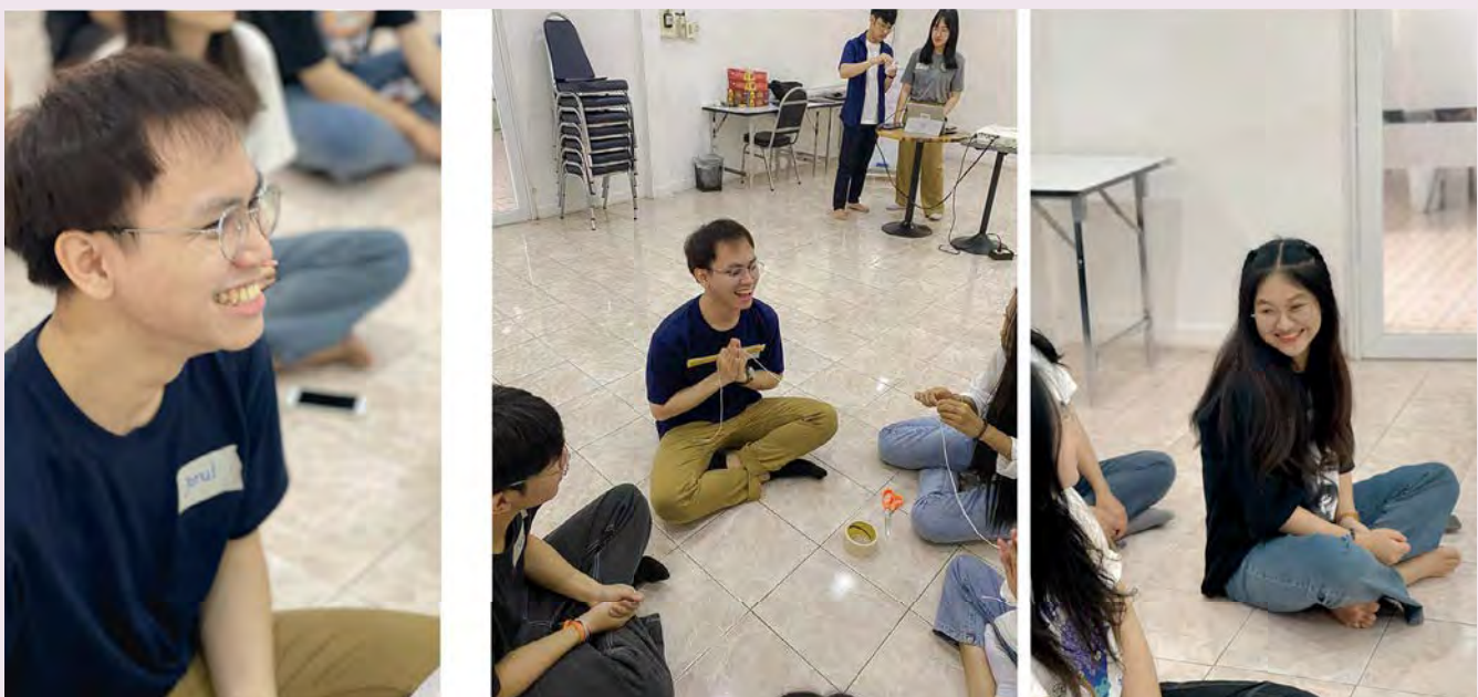
"One Health Leaders" was broadcast through LAOHUN's One Health Student club Facebook page.

Upon hearing advice from senior members, student leaders expressed their enormous gratitude, saying that small seeds were planted through the orientation that have the ability to sprout into something bigger for new students as they move forward in their careers. The students were especially grateful for the opportunity to meet others that have found success in the One Health field, as well as the chance to hone their collaboration skills with their peers across multiple generations.