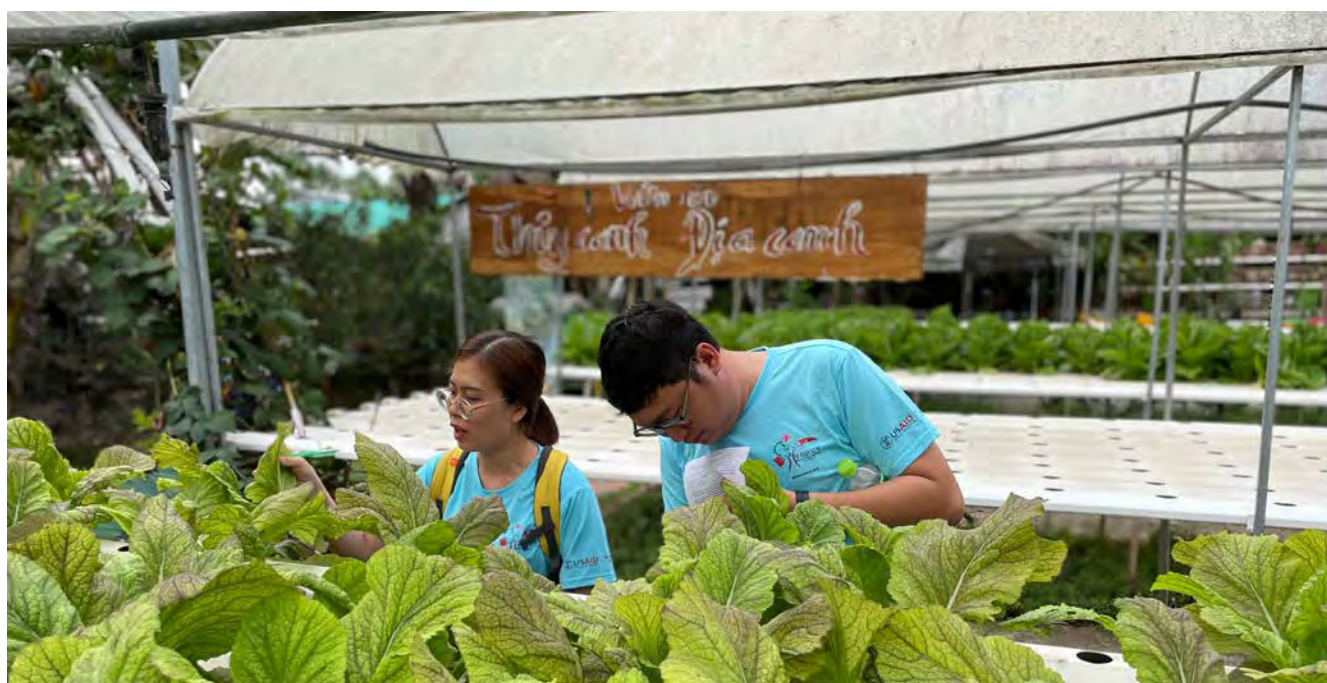
In-service professionals learned how to identify health problems through field trip activity organized by VOHUN, 30-31 March 2023.