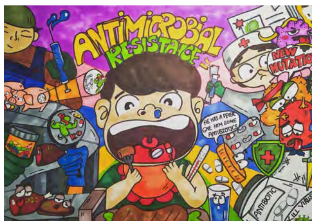
Thai Binh University of Medicine and Pharmacy (TBUMP)'s One Health Club in Viet Nam was awarded the Public Pick Award for non-digital art through online public voting, 24 November 2023.

On 18-24 November 2022, SEAOHUN hosted its 3rd Annual Regional Student Competition on the theme of "Art to Communicate Anti-microbial Resistance" in celebration of World Anti-microbial Awareness Week (WAAW). The competition aimed to raise awareness of AMR using creative communication, and 12 out of 47 teams won digital and non-digital art awards. The non-digital art winning team from Viet Nam, "TBUMP One Health Club," won the Public Pick Award through online public voting. The competition allowed students to upgrade their technical knowledge, creative skills and encouraged young professionals from multidisciplinary backgrounds to apply the One Health concept in their communities.