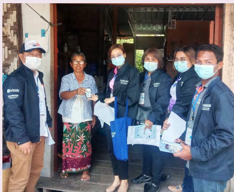
Village Health Volunteers practised on community-based survey to promote effective responses to emerging disease outbreaks, 9-10 March 2023.

After the workshop, THOHUN provided the VHVs in Ranong, Surat Thani and Chumphon with tools and materials used for community problem assessment, activity prioritization and stakeholders’ matrices, and implementation planning templates for community application. The training participants provided their feedback and shared their experiences regarding the knowledge and tools they learned from the workshop via an online communication platform. The positive outcome of the workshop will be a steppingstone for THOHUN to continue empowering VHVs across Thailand in advocacy and promoting effective responses to emerging disease outbreaks.