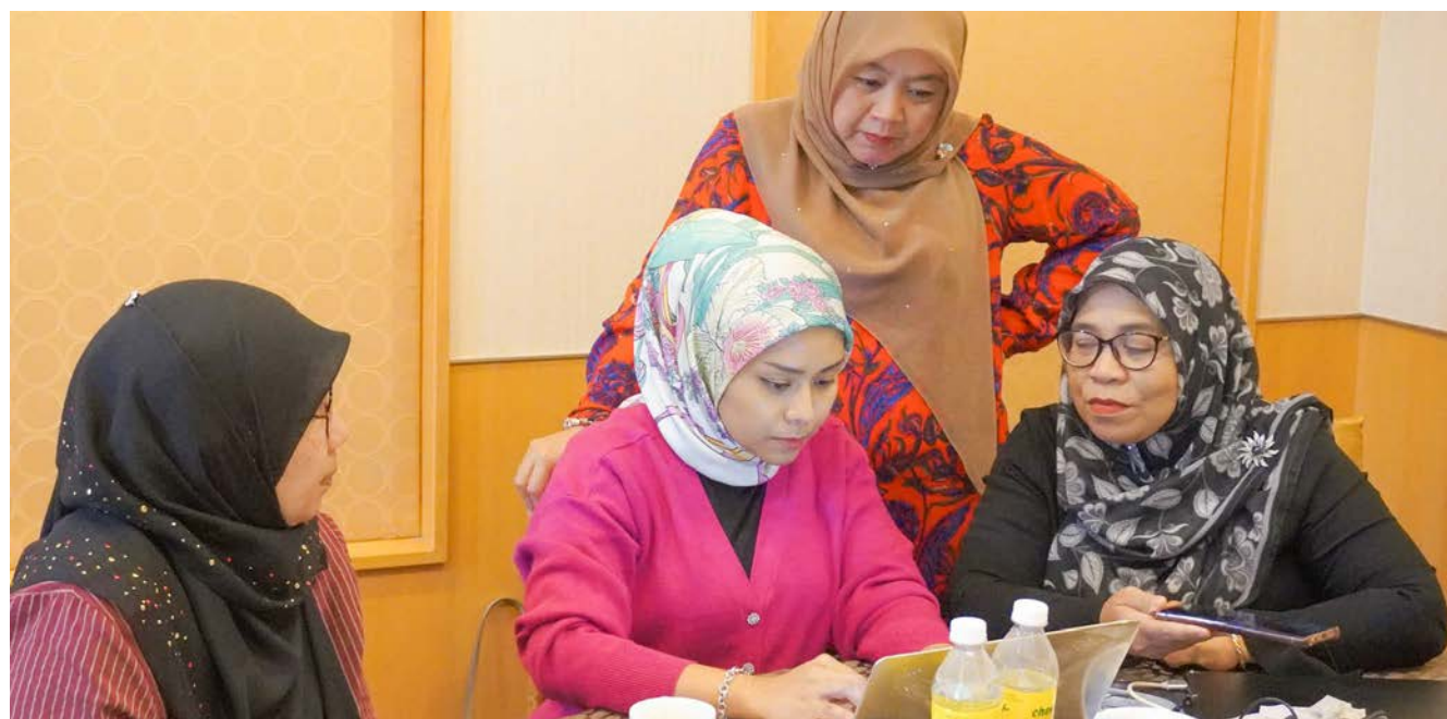
Group discussion during MyOHUN Year 4 Strategic Planning meeting at the Hotel Inn in Melaka, Malaysia.

Investing in continuous learning and skill-building for professionals is critical to ensure that the workforce is equipped with the tools and knowledge needed to