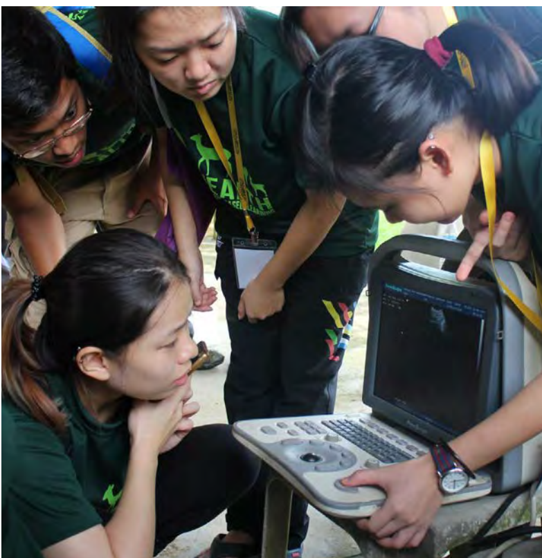
Practical learning experience by using a scanning machine to examine pregnant animals.

To sustain and expand our efforts, MyOHUN must explore charging fees for our activities. This will help to mobilize more resources and improve the quality of the training. For example, MyOHUN could explore various charging models such as fee-for-service, subscription-based, or sponsorship-based models to generate revenue for our activities. This step would ensure the long-term sustainability of MyOHUN's efforts to strengthen the One Health workforce and respond to emerging global health threats. However, MyOHUN is committed to keeping these fees as affordable as possible while maintaining the quality of training.