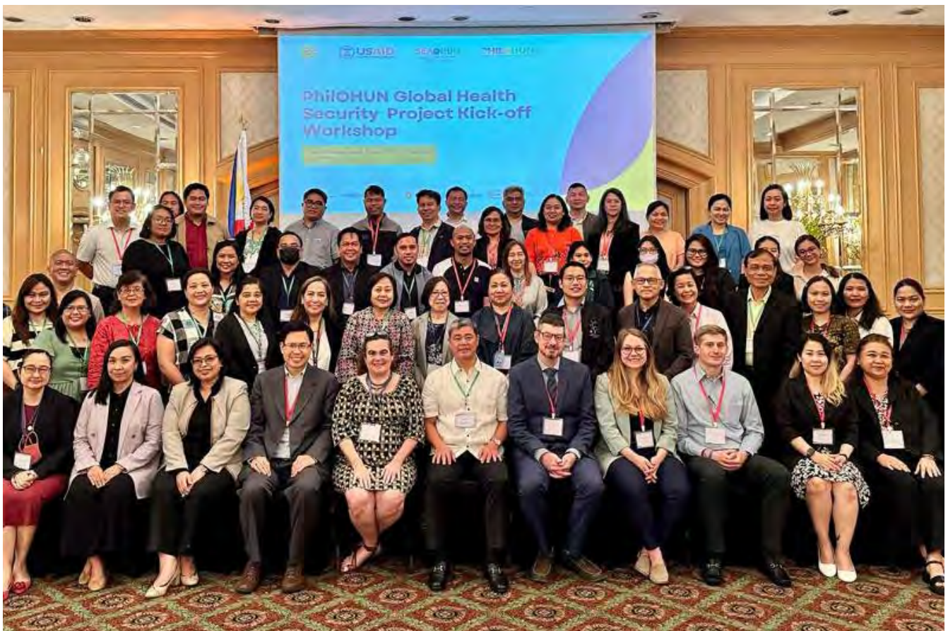
PhilOHUN GHS Project kick-off meeting at the Heritage Hotel, Manila, the Philippines, 28-29 March 2023.

The overall objective of the meeting was to identify key capacity development gaps across various time scales and to adjust the project accordingly. These were addressed by introducing the GHS Project, reviewing the 2018 International Health Regulation (IHR) Joint External Evaluation results, defining key results and critical activities needed to address knowledge gaps, surveying the IHR resource landscape for Human Resource development, and identifying opportunities for PhilOHUN and key stakeholders. 69 participants representing eleven PhilOHUN member Universities, the OHW-NG Global Team, USAID Philippines, the Philippines Inter-Agency Committee on Zoonoses, and the Department of Health Bureau, as well as representatives from key international agencies such as SEAOHUN and PhilOHUN actively participated in the kick-off meeting.