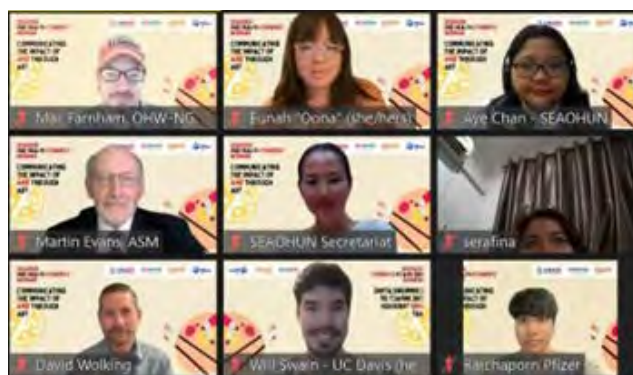
SEAOHUN organized a webinar session to share about Antimicrobial Resistance and Art Communication.